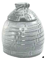
803—HONEY JAR W/LID 4.75

HONEY JUGS Not Available in Terra Cotta.