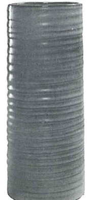
72—10" RINGED CYLINDER VASE 6.50