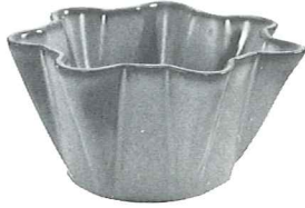
F33—3¾x7" FLUTED PLANTER 5.50