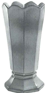
64—9½" OCTAGONAL VASE 7.75