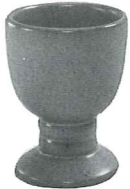
26LC—4½"—6 OZ. TUMBLER VASE 3.25