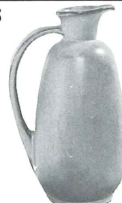
835—24 OZ. PITCHER 3.75