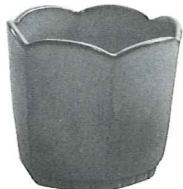
37—4" HEXAGONAL PLANTER 3.25