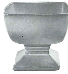
23A—6" SQ. PEDESTALLED VASE 6.50