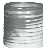
272—4" RINGED CYLINDER VASE 3.25