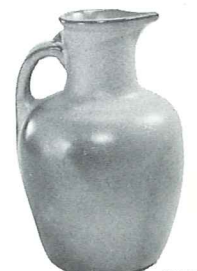
8—24 OZ. PITCHER 3.75

AVAILABLE IN 8 STANDARD COLORS PLUS WISTERIA, COFFEE BROWN & TERRA COTTA - EXCEPT WHERE NOTED - ADD 50% FOR FLAME