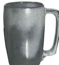
5M—5½"—16 OZ. MUG 4.50