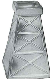
199—OIL DERRICK VASE 7.00