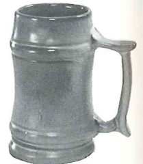
M2—6"—18 OZ. MUG 4.50