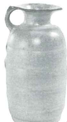
831—16 OZ. PITCHER 3.75