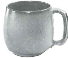
4M—4½"—18 OZ. MUG 4.50