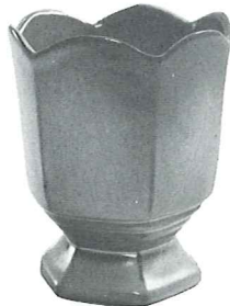
65—6½" HEXAGONAL VASE 6.50