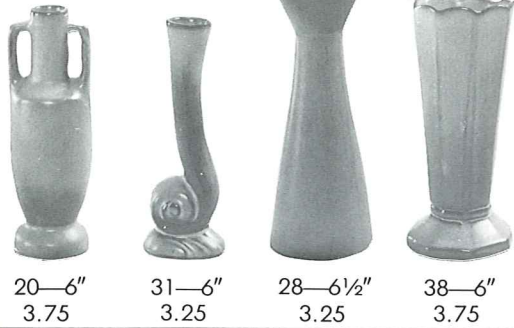
20—6" 3.75 31—6" 3.25 28—6½" 3.25 38—6" 3.75

Small containers perfect for miniature or dried arrangements.