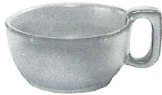
4SC—5" CUP-BOWL 3.75