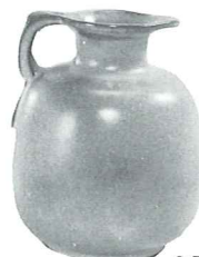
833—24 OZ. PITCHER 3.75