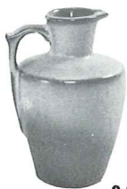
838—10 OZ. PITCHER 3.25