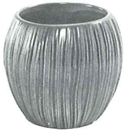
T7—3½" COCONUT PLANTER 2.75