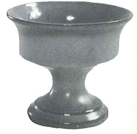
F52—7" PEDESTALLED URN 6.50